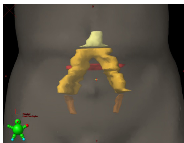
Figure 3. Comparison of upper border based on bony landmarks and the nodal stations on computed tomography (CT) scan. Red — L5-S1 junction, yellow — common iliac vessels, mustard — internal and external iliac vessels, orange — obturator vessels

which examined 60 patients and demonstrated that the use of L5-S1 as the superior border of radiation therapy fields in rectal cancer would lead to a 94% omission of internal iliac nodes. Similarly, Sanjee et al. [18] compared 2-dimensional and 3-dimensional plans in 86 patients with rectal malignancies and found that 32 out of 86 patients experienced a geographical miss of internal iliac nodes when L5-S1 was used as the superior border.