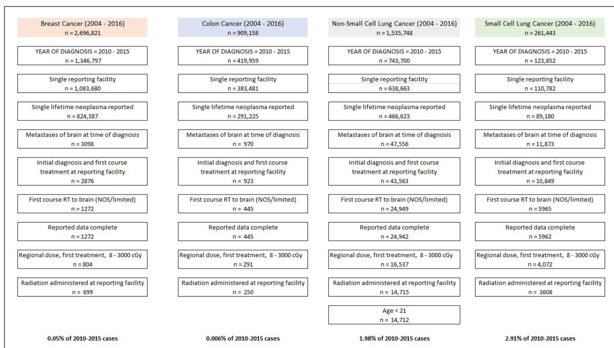
Figure 1. Schematic diagram of exclusion and inclusion criteria based on variables for patients from breast, colon, non-small cell lung and small cell lung cancer databases. Number eligible after each selection criterion is provided (n = 19,269). Final exclusion required to estimate hospital volume based on facility reporting for each study year was made after compiling the dataset. Final number eligible subjects = 18,841

Patient age, sex, income, race, facility type (academic/research facility, comprehensive cancer