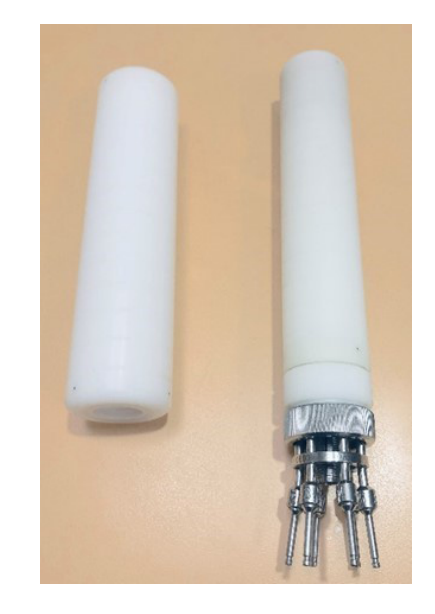
Figure 1. Miami Style applicator set — VARIAN medical systems

Application was done as an outpatient procedure. A vaginal examination was done before insertion to assess the size of the obturator sleeve required. The appropriate size of the applicator was inserted in the vagina and pushed inside until the patient winced. The applicator was held in place by an abdomen tie. For the first application, a noncontrast simulation CT scan with the applicator in situ was obtained. A fiducial marker was placed at the introitus, and 3 mm slice images were obtained from L5 to the upper femur on a 16-slice, 80 cm bore diameter Phillips CT scanner. The upper and lower levels of the CT scan were chosen for uniformity and reproducibility.