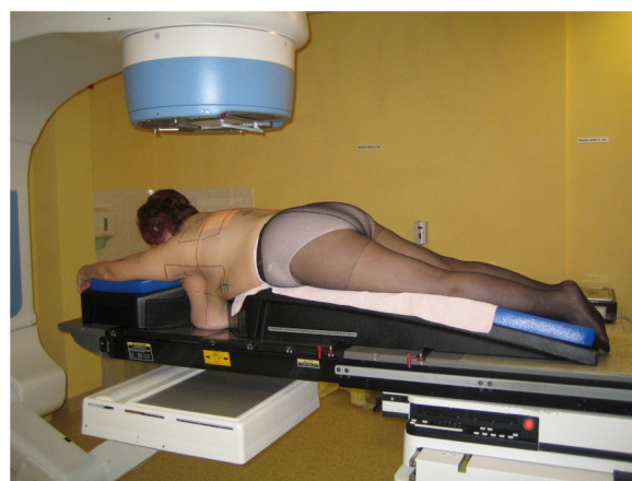
Fig. 2. Prone position.

chambers, vessels and valves. According to several studies, cardiac mortality reflect a risk of radiation – induced atheroma in the anterior descending coronary artery function of total dose rather than the length of the artery exposed.