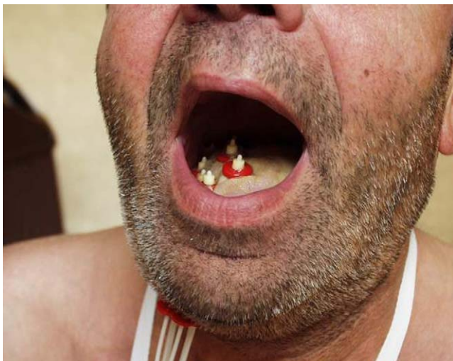
Fig. 2 – Implantation of afterloading catheters.

The Kaplan–Meier survival analysis was used for the estimation of survival functions.