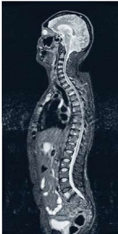
Fig. 1. Multifocal lesions, Stage III: b – sagittal STIR image: high signal focal lesions in the skull, sternum and vertebral bodies with collapsed Th2, c – sagittal SE T1-W image: low signal lesions in the sternum and vertebral bodies

3. Mixed type (diffuse foci seen against the infiltrative lesion background) – detected in 19 patients