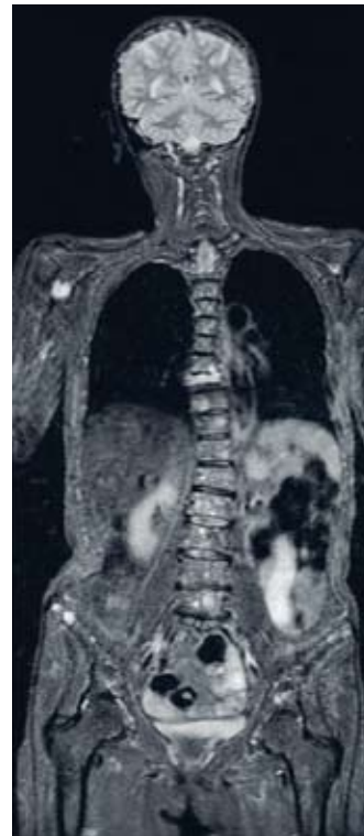
Fig. 4. Multifocal lesions, Stage III: a – coronal STIR, high signal lesions in the spine, pelvis, skull

was observed, usually located paravertebrally or in the pelvis. (Fig. 2). Forty-five subjects suffered from the fracture of at least one thoracic vertebra and 28 experienced fractures of lumbar vertebrae. Femoral frac-