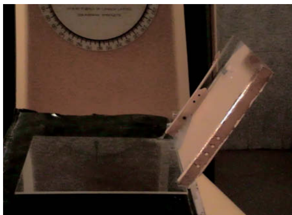
Figure 1. The dedicated cassette holder made from perspex is shown on the treatment couch.

Twenty two patients who had undergone partial or total mastectomy and were presently undergoing