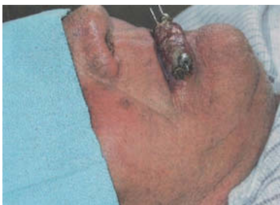
Figure 2. The plane of interstitial implants.