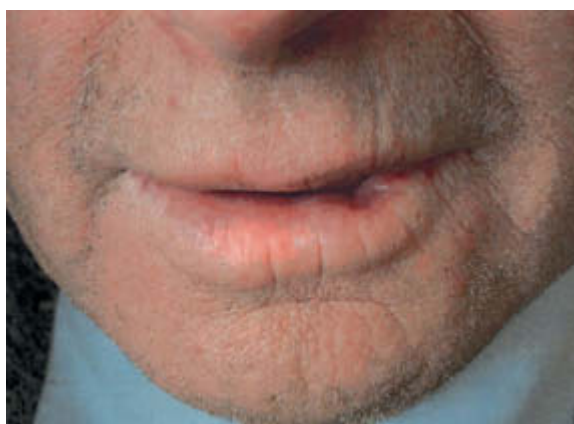
Figure 6. Effect of treatment after 24 months. Only a small loss of tissue at the primary tumour site is observed. No telangiectasia or fibrosis is detected.

of 237 patients, treated with the LDR technique in the period 1972–1991, in which local control was achieved in 95% of cases at 5 years and, by applying salvage surgery, this figure has now risen to as much as 99% of all cancer patients. The risk of late complications depended on the size