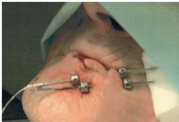
Figure 5. The implant covering the remaining infiltrate in the area below the corner of the mouth, the tumour pole above the corner has disappeared.