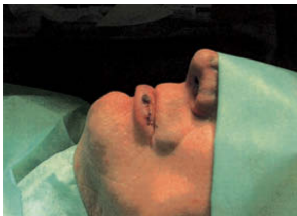
Figure 1. A typical T1N0M0 patient with squamous cancer of the lower lip.