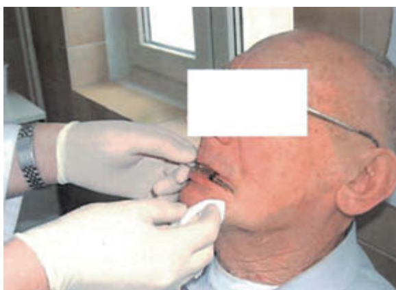
Figure 3. Control of the proper implant geometry between fractions (day 8).