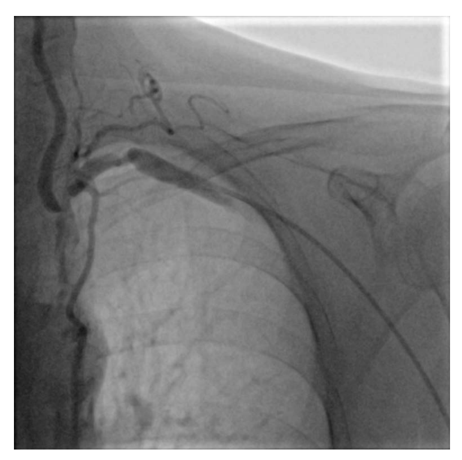
Figure S2. Severely narrowed left subclavian artery