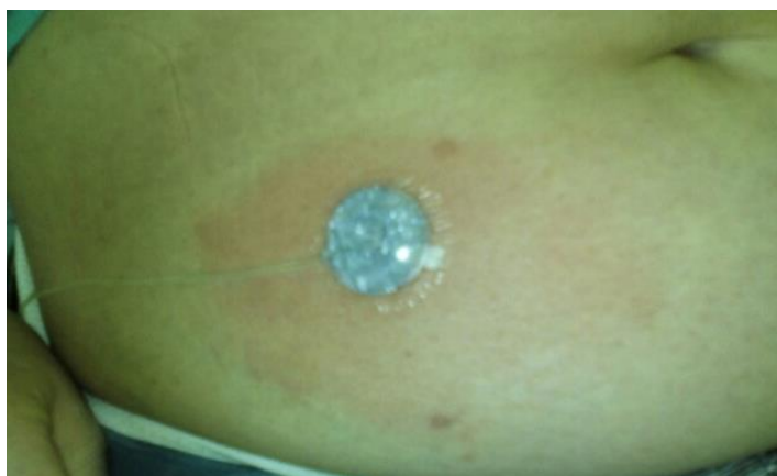
Figure S1 Erythema on the abdomen around the injection site for treprostinil infusion

Please note that the journal is not responsible for the scientific accuracy or functionality of any supplementary material submitted by the authors. Any queries (except missing content) should be directed to the corresponding author of the article.