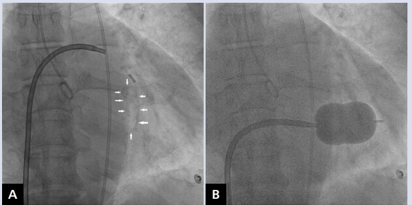
Figure 2. A. Calcified mitral valve (white arrow showing calcium); B. Successful percutaneous transmitral commissurotomy as Accura balloon is perfectly expanded at its waist across the mitral valve