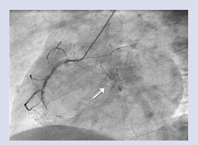
Figure 3. Coronary angiography. Chronic total occlusion of right coronary artery and rich vascularisation of the tumour (arrow) arising from a proximal branch