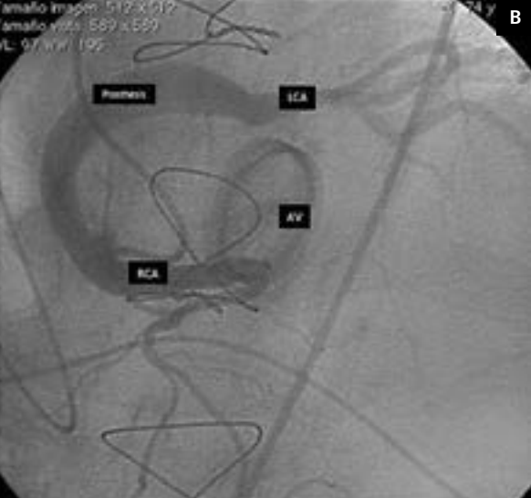
Figure 1. A. Cinecoronariography projection showing medial Dacron graft connection to the descending aorta and distal ends anastomosis to the right coronary artery (RCA) and left coronary artery (LCA). The RCA had a critical lesion in the proximal anastomosis; B. Proximal RCA anastomosis after angioplasty. Mechanical valve in the aorta (AV)