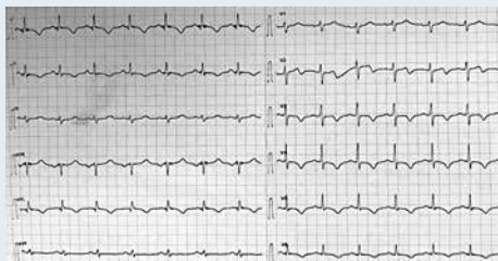
Figure 3. Electrocardiogram 24 h after the event