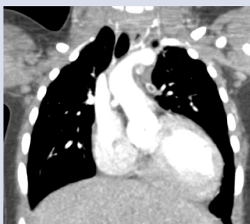
Figure 1. Computed tomography scan of described patient with pulmonary atresia and ventricular septal defect