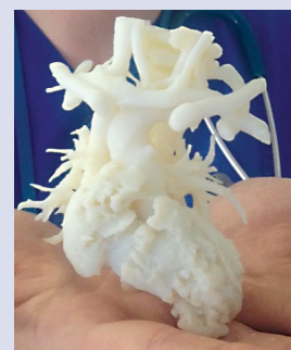
Figure 3. Three-dimensional printed model of the heart and pulmonary vessels with complete agenesis of pulmonary artery bed