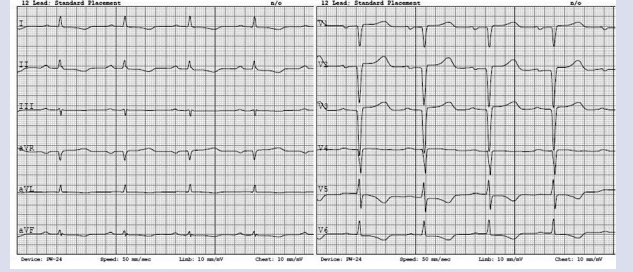
Figure 1. The standard 12-lead electrocardiogram showing sinus rhythm with low QRS voltage in the limb leads, QS complexes in V1–V3 leads, and nonspecific ST-T wave changes in the limb and precordial leads