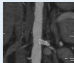
Figure 3. Critical stenosis of the right renal artery and stents in both branches of the left renal artery (upper branch 4 mm, lower branch 2 mm; both fully patent)

vertebral, or subclavian arteries. On the basis of CRP (8.2 g/L) and imaging tests the dose of methylprednisolone was reduced. We did not confirm the presence of HLA-B52, which in several reports is more prevalent in patients with UC/TA and is associated with worse outcomes. Although the coexistence of TA and UC is rare, it should be taken into consideration by cardiologists during diagnosis and treatment of patients; moreover, PET/CT would probably be useful for the evaluation of the disease activity and distinguishing between vasculitic and inflammatory bowel disease-related changes in gastrointestinal tract.