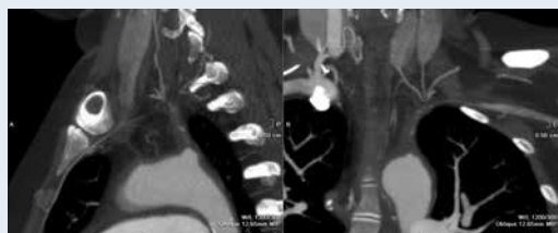
Figure 2. Critical stenosis of the left subclavian artery — residual flow visible