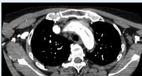
Figure 1. Preoperative chest computed tomography scan. Aortic dissection — Stanford type A

took 7 h 10 min, ECC-time was 3 h 22 min, aortic cross clamp time was 1 h 57 min, and circulatory arrest time was 30 min. The postoperative period passed uneventfully. The patient, in a haemodynamically and respiratorily stable state, was discharged 12 days after the surgery to the Department of Cardiology for further rehabilitation. The simultaneous surgical procedures can be safely done after meticulous preparation and diagnostics as well as good constipated surgery sequence. It has to be stated, however, that it requires an individual approach in an environment of an experienced surgical team.