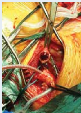
Figure 3. Carotid artery cannulation