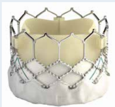
Figure 2. Edwards Sapien 3 valve with outer and inner skirt