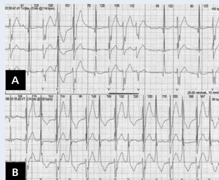
Figure 2. Strips of three-channel 24-h Holter monitoring. Sinus rhythm. Monomorphic (A) and bidirectional (B) non-sustained ventricular tachycardia