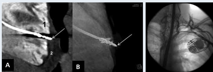
Figure 3. CT (arrow) perforating lead tip; A. Multiplanar reconstruction; 1 — right heart cavity with contrast medium; 2 — pericardial sac space; B. Volume rendering technique