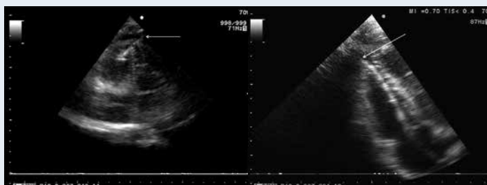
Figure 2. TTE (arrow) the lead tip in pericardial space