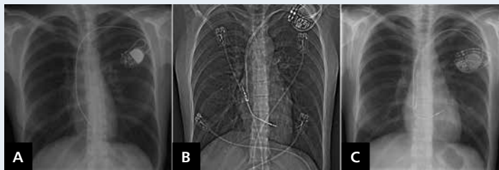
Figure 1. Chest X-ray in PA projection; A. VVI pacemaker; B. Perforating lead; C. Final pacemaker