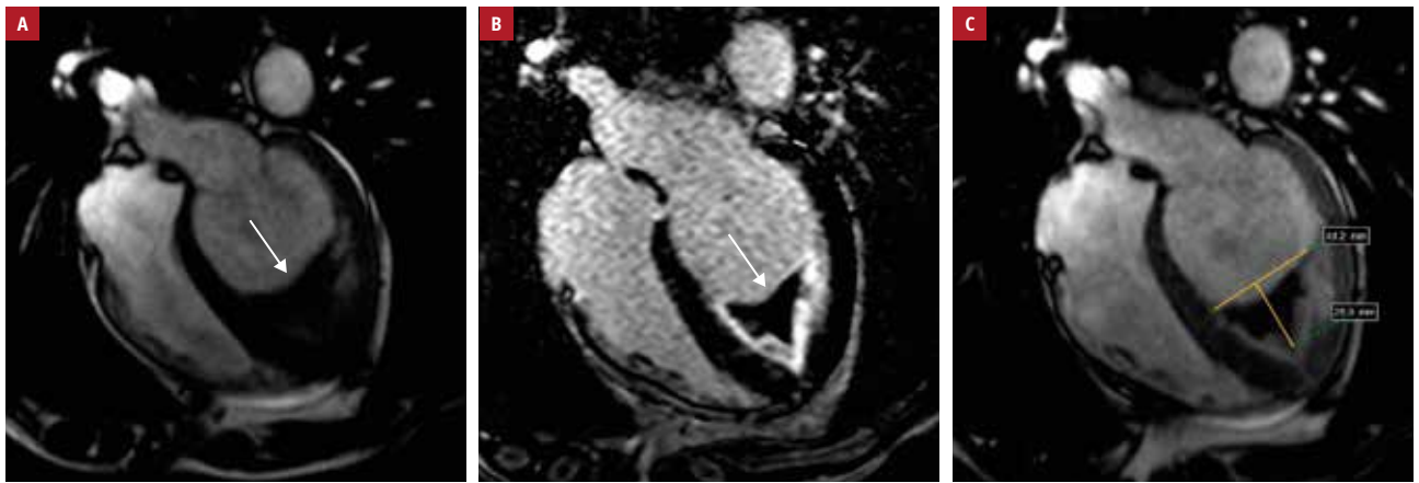
FIGURE 2 A comparative cardiac magnetic resonance at 6 months after a period of poor compliance to anticoagulant treatment: an extremely large thrombus (arrow) in the apical to mid segments of the left ventricle and more extended areas of advanced endocardial fibrosis; A – cinematographic sequence; B – late gadolinium enhancement sequence; C – early gadolinium enhancement sequence in the 4-chamber view

endocardial fibrosis (FIGURE 2). Evidence-based therapy was administered with LMWH, azathioprine, and glucocorticoids, and the patient was finally discharged to a nursing home where he received optimal medical treatment to improve his compliance.