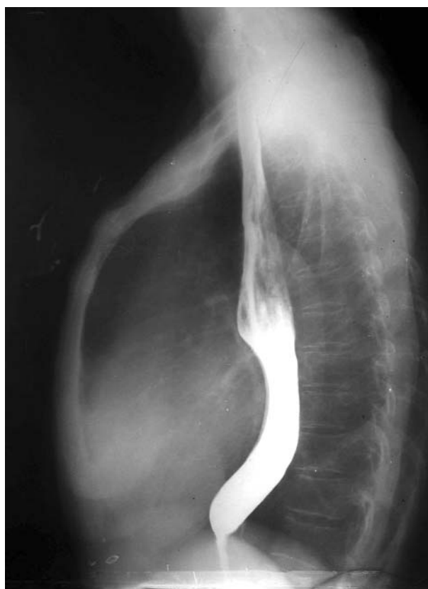
Figure 2. Chest radiogram with barium swallow showing dilated oesophagus with rat tail appearance of terminal oesophagus (lateral view)

enlargement. The patient underwent upper GI endoscopy which revealed a dilated distal segment of the oesophagus with no mass lesion and with abrupt narrowing of the distal segment.