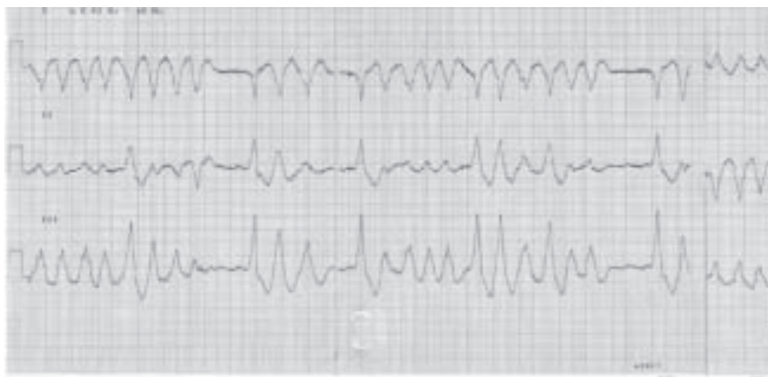
Figure 1. Polymorphic ventricular tachycardia occurring ten days after myoblasts injection [RR 180/60 mm Hg; 25 mm/s; 10 mm/mV]

Using an ultrasound strain we observed a very good recovery of myocardial function 12 months after the procedure. Echocardiographic quantitative tissue Doppler analysis showed the essential improvement of longitudinal strain from about 10% up to 17–24%; this is within normal limits for healthy subjects and maximal deformation from post systolic strain to ejection time. Significant improvement of regional myocardial velocity from maximal 2.4 m/s to more than 4 m/s, especially in the lateral wall, and a clear increase of global LV diastolic function was revealed (Fig. 3).