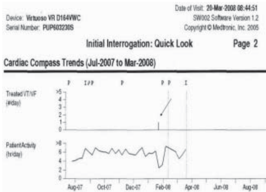
Figure 2. Records from an ICD memory during follow-up. Arrow shows an episode of recurrent ventricular tachycardia after mexiletine had been discontinued