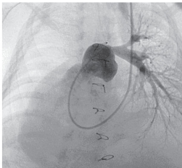
Figure 2. Angiography performed two months after arterial switch operation reveals high right ventricle pressure and hypertrophy

cardiography. Angio-computed tomography (CT) scans demonstrated critical stenosis in the proximal part of the right PA and mild stenotic changes of the left PA (Fig. 1).