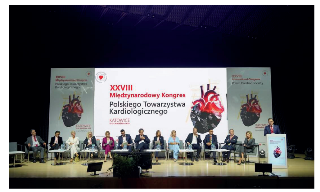
Figure 1. 28th International PCS Congress in Katowice (September 18, 2024)

To address the dynamic development of cardiology, specialist working groups of the Society were established, starting from