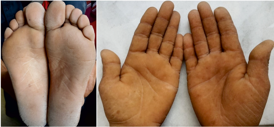
Figure 1. A rugose appearance with a ridged surface, mimicking the tripe of a ruminant, on the palms and soles