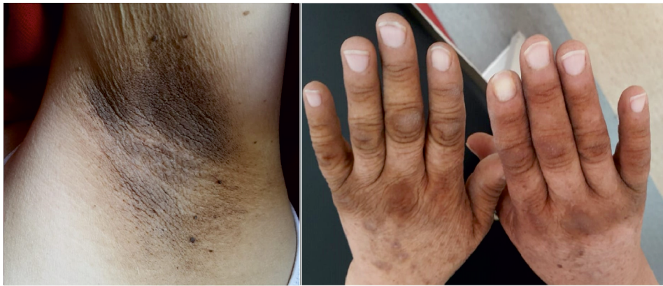
Figure 2. Hyperpigmentation of skinfolds (acanthosis nigricans) on the armpit and fingers

no abnormal value in the laboratory analysis. Abdominal ultrasonography was performed and there was no additional abnormality except grade 2 hepatosteatosis. The presence of tripe palm and acanthosis nigricans in our patient suggested malignancy. Gastroduodenoscopy was performed. Malignant ulcer was detected in the stomach (antrum) (Fig. 3) and biopsy was taken. The result showed gastric adenocarcinoma. Thoracic and abdominal computed tomography was performed for cancer staging. Stomach wall thickness increased and there were no distant metastases. Neoadjuvant chemotherapy in form of FLOT regimen was initiated because of the diagnosis of early-stage gastric cancer. Paraneoplastic tripe palm and acanthosis nigricans regressed. There was a slight decrease in gastric wall thickness after 4 cycles (detected in computed tomography of the abdomen). Total gastrectomy and D2 lymph node dissection were performed. Postoperative pathology report revealed adenocarcinoma. The same chemotherapy regimen was started again in the postoperative 8 th week and 4 cycles were given. Paraneoplastic tripe palm and acanthosis nigricans completely disappeared. The patient was observed with no evidence of progressive disease.