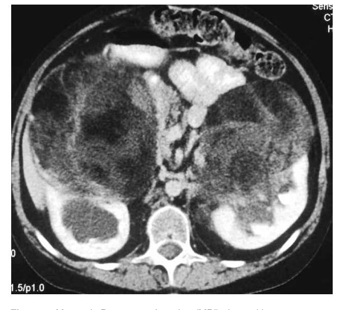
Figure 1. Magnetic Resonance Imaging (MRI) showed large space occupying lesions anterior to the kidneys. They showed compressive effect on renal pelvises and calyceal system, with secondary hydronephrosis