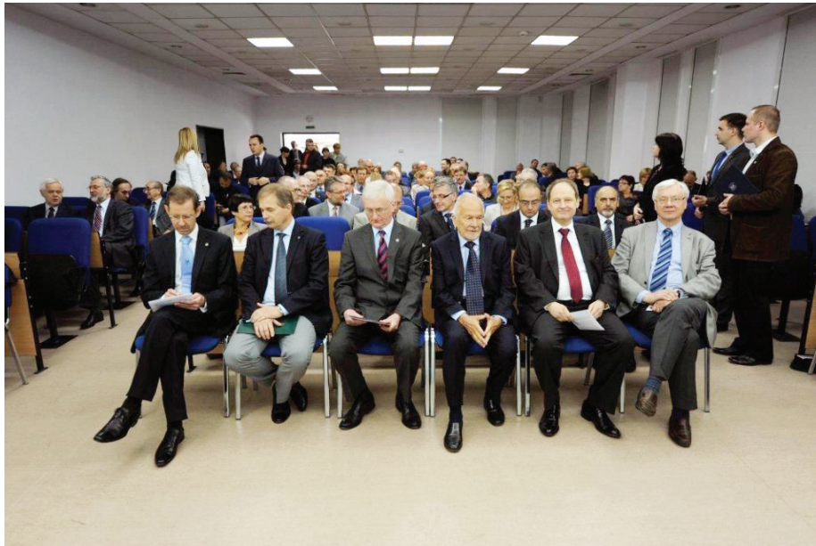
Figure 2. Opening ceremony guests