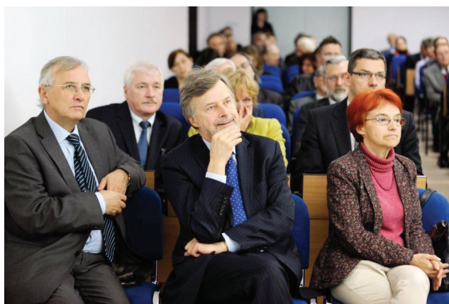
Figure 1. Opening ceremony guests

Besides the 100 micro-Amperes proton machine, the new Centre disposes of two adjacent laboratories equipped with hot cells, radiopharmaceutical synthesizers and dispensers. The first