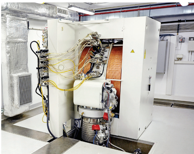
Figure 3. GE PETtrace p/d cyclotron