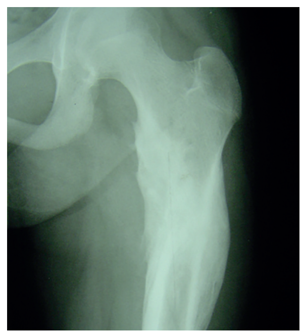
Figure 6. X-ray image 10 years after the surgery with visible remodeling in place of the removed bone cyst

treatment should be chosen individually depending on the location, extent and malignancy of the tumor [2]. However, despite many treatment techniques, between 5 and 40% of relapses are described [3].