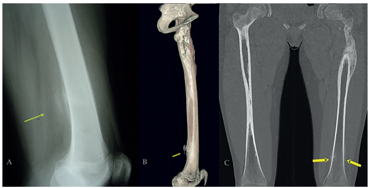
Figure 5. A – X-ray of the distal femur with the current lesion; B – Computed tomography with 3D reconstruction; C – Image of bone lesion in CT sections