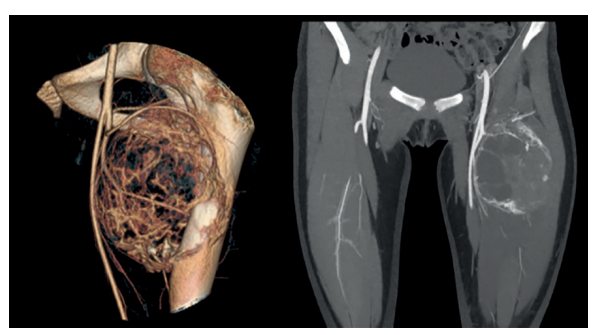
Figure 2. Image in computed tomography of the proximal part of the femur with 3D reconstruction

was observed. The thigh biopsy showed no pathological lesions. The pain disappeared spontaneously after a few days, so further diagnostics of the lesions found in scintigraphy was not continued.