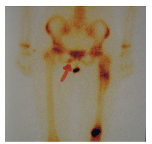
Figure 4. Scintigraphy of the skeleton showing hot areas in the right pubic bone and further parts of the femur

visible. One year after the surgery, the patient returned to full active and passive mobility and range of mobility. She did not feel any pain, either. Changes in the X-ray image of the right pubic bone and left femoral bone remitted spontaneously. 10 years after the diagnosis of the aneurysmal bone cyst, no recurrence or other ailments were observed (Fig. 6). Currently, the patient is physically active and practices sports.