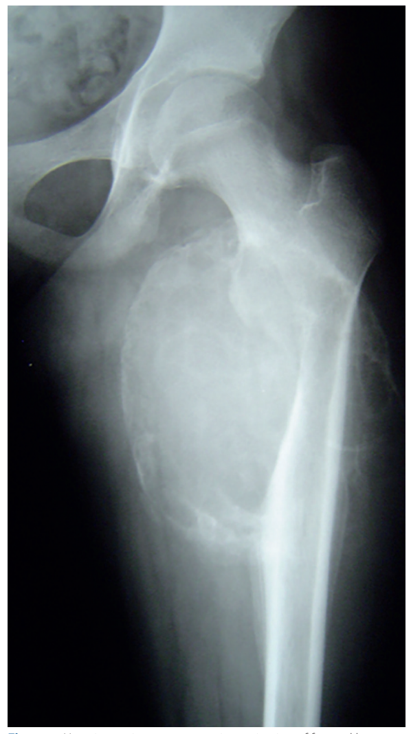
Figure 1. X-ray image in antero-posterior projection of femoral bone with visible massive, diffusing bone lesion