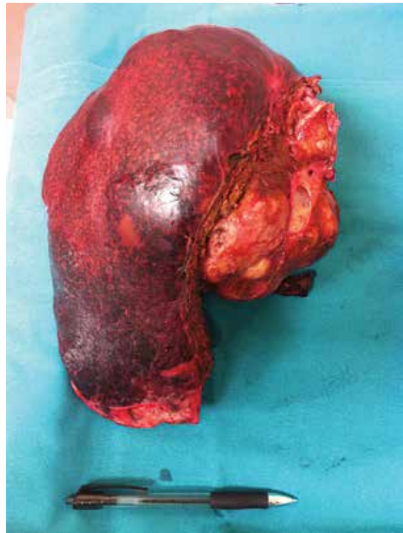
Figure 2. Removed right lobe of the liver along with tumor

The intention of this paper is to emphasize the importance of appropriate general management of elderly patients prior to surgery as a safe and risk-minimizing protocol. Certain authors conclude that the appropriate selection of patients for liver resection gives the best results [7]. With this we can agree, as long as we don't discard elderly patients, since there still remain controversies concerning whether advanced age increases peri-operational risk and effect morbidity [8]. With the improvement of medical treatment in all fields of medicine and longer overall survival, we are looking at a natural expansion of candidates awaiting liver resection. We predict that very soon the mean age of operated patients might reach the 3 rd decade. Operating an 80 year old patient