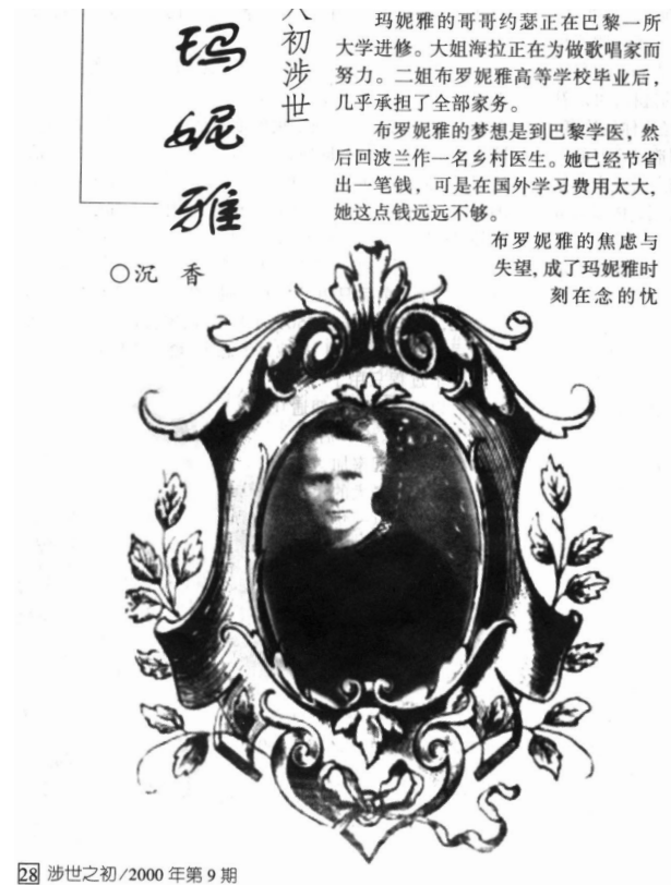
Fig. 1. Title column from Starting Life [2].