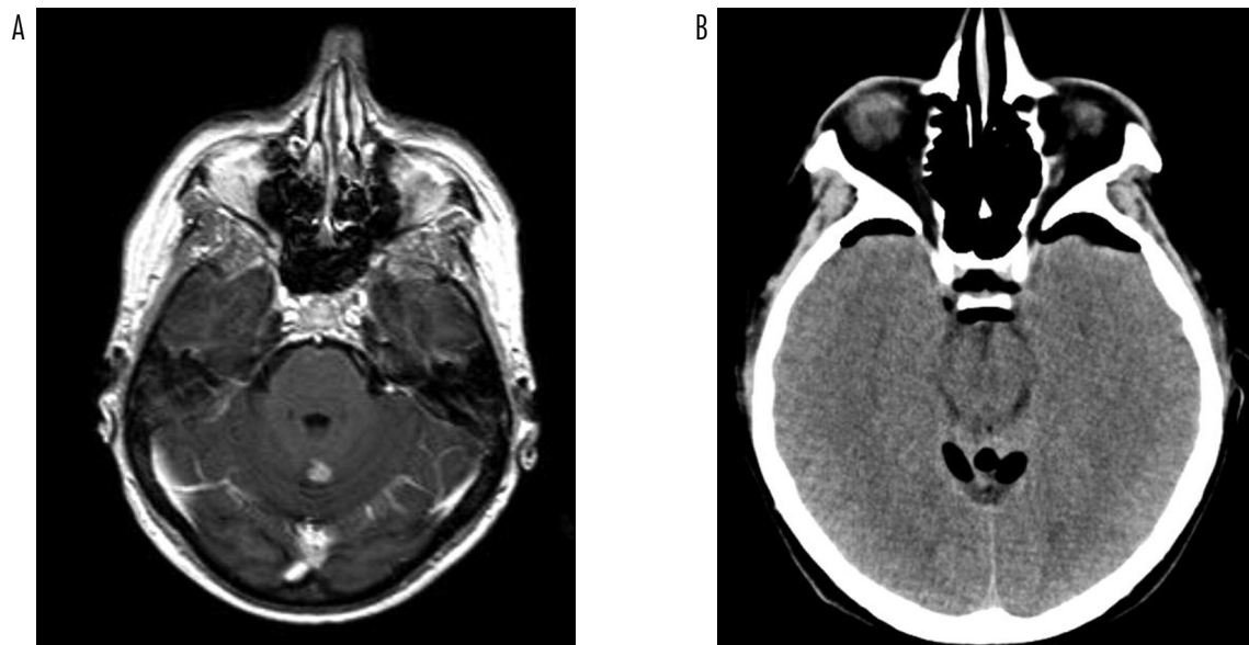
Fig. 3. MRI before surgery and intraoperative CT – assessment of tumour removal

In eight patients, intraoperative CT was used to evaluate the position of the ventriculoperitoneal shunt, ventricular drainage and drain of the Rickham tank. The study was not performed routinely, but only in the