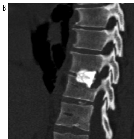
Fig. 5. MRI before and CT after thoracic discectomy by thoracotomy