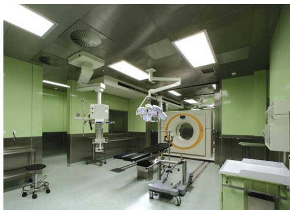
Fig. 1. Operating room with CT - SOMATOM Sensation Open