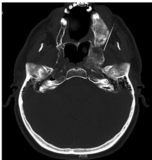
Fig. 4. CT during Gasserian ganglion electrocoagulation in patient with craniofacial fibrous dysplasia

During the tumour surgery, radicality of tumour resection was evaluated in four cases of small tumours, despite the use of intraoperative neuronavigation (Fig. 3).