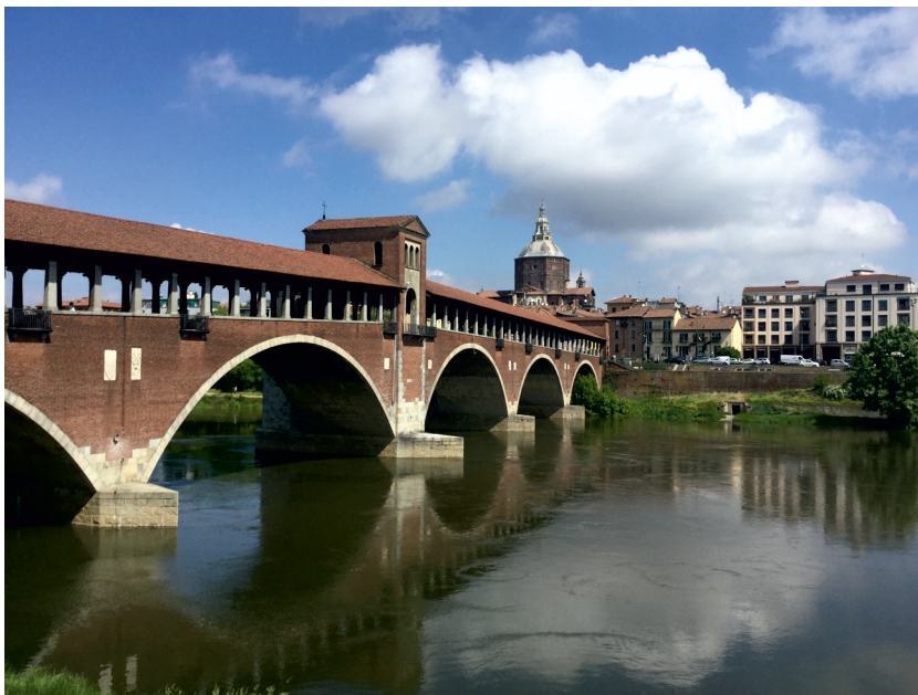
Figure 3. Pavia's Covered Bridge, source: author's archival materials

and Antonio Scarpa and Lazzaro Spallanzani anatomy, Ugo Foscolo and Vincenzo Monti humanities, Carlo Forlanini, the inventor of artificial pneumothorax, medicine. In the early 1900s, the anatomist Camillo Golgi was the first Italian to receive the Nobel Prize.