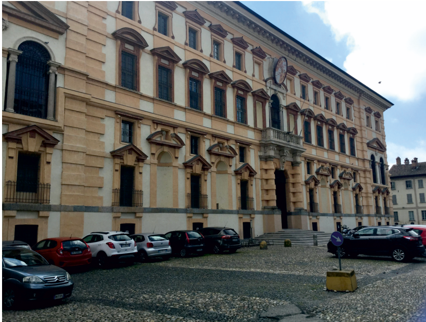
Figure 2. University of Pavia, source: author's archival materials