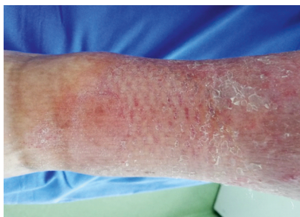
Figure 9. Changing the wound dressing 12 weeks post-operatively. The picture was taken on 12 th June 2018

pital on the same day with a total hospitalisation time of 14 days. The donor area was cured by bandaging it with sterile gauze bandages. The patient was re-banded in two weeks postoperatively in the same way as the first time and later repeatedly re-banded four more times: at three weeks (Fig. 6), seven weeks (Fig. 7), eight weeks (Fig. 8), and 12 weeks (Fig. 9) postoperatively using silver containing hydro fibre dressing for the transplanted site. The sutures and paraffin net were removed on the third appointment three weeks post-op. No signs of infection were seen during healing time.