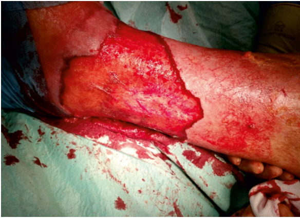
Figure 2. Surgical debridement of the ulcer performed on 14 th March 2018