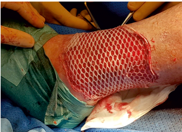
Figure 4. Skin transplantation with split-thickness skin graft performed on 22 nd March 2018