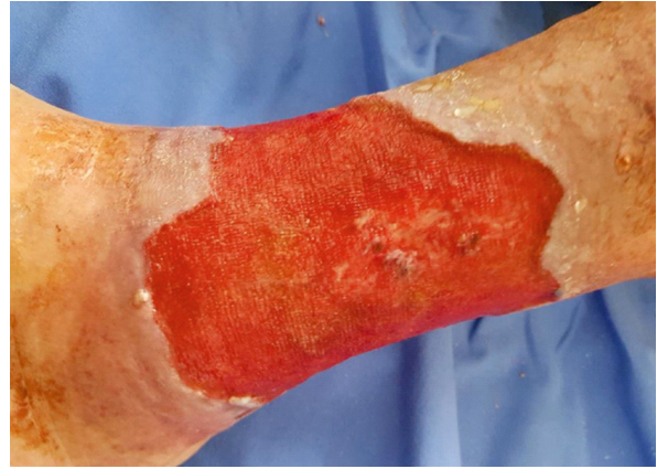
Figure 3. First day after surgical debridement — signs of granulation tissue on the wound bed. The picture was taken on 15 th March 2018