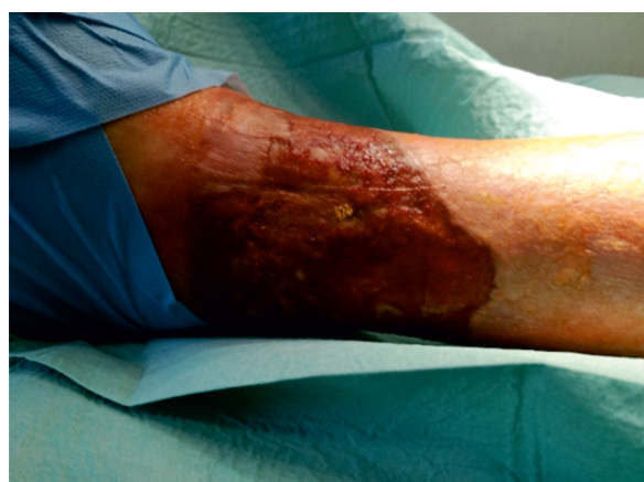
Figure 1. Chronic venous ulcer of the left ankle — visible biofilm and signs of infection. The picture was taken on 14 th March 2018

On 13 th March 2018 a 75-year-old male patient came to our out-patient clinic with chronic trophic ulcer for five years. The venous origin of the trophic ulcer was approved by the clinical course: of course — a visible