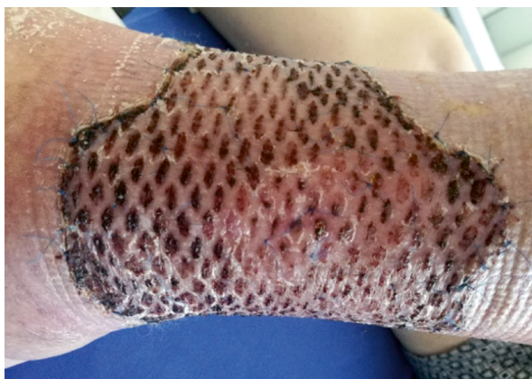
Figure 6. Changing the wound dressing 3 weeks post-operatively. The picture was taken on 10 th April 2018