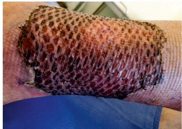
Figure 5. Changing the wound dressing 5 days postoperatively. The picture was taken on 27 th March 2018

diagnosis of chronic skin ulcer without any signs of a tumour. Ultrasonography showed insufficiency of the left great saphenous vein and chronic deep vein thrombosis of the left leg — femoral vein, popliteal vein, and calf veins. A culture from the ulcer revealed growth of several gram-positive and gram-negative bacteria: pseudomonas aeruginosa , Streptococcus constellatus , Enterococcus faecalis , and Bacteroides fragilis . Blood test showed elevated CRP (13.1 mg/L). No signs of peripheral artery disease were discovered — the patient had strong distal pulses. He also had chronic atrial fibrillation and primary arterial hypertension. The patient was previously unsuccessfully treated with zinc-gelatine impregnated bandages. Our treatment plan consisted of systemic antimicrobial therapy, which was prescribed by our clinical pharmacologist, surgical debridement, phlebectomy, as well as split-thickness skin transplan-