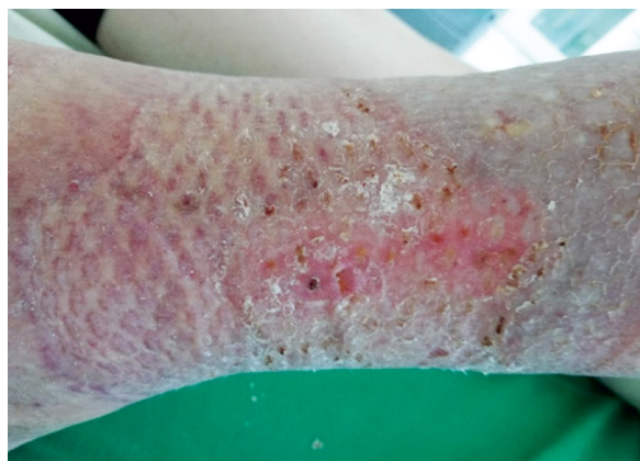
Figure 7. Changing the wound dressing 7 weeks post-operatively. The picture was taken on 8 th May 2018