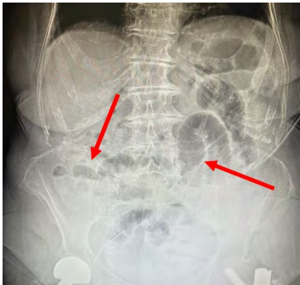
Figure 1. Abdominal X-ray showed short fluid levels in the mid-abdomen and distended intestinal loops. Red arrows represent described changes

The next day, an ultrasound examination (USG) revealed distended loops of the small intestine with residual liquid contents and free fluid between the loops. The patient was urgently qualified for surgical treatment. An exploratory laparotomy was performed under general anaesthesia. After opening the peritoneal cavity, a small amount of yellowish fluid was aspirated. In the small intestine, about 10 cm from the Bauhin's valve, a hard, movable lesion with a diameter of about