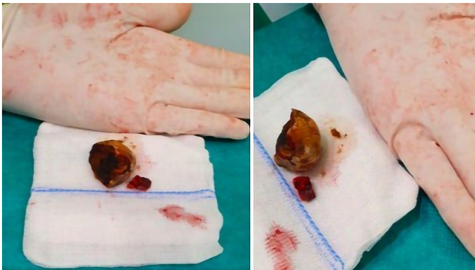
Figure 2. The gallstone

Biliary obstruction occurs as a result of blockage of the digestive tract by a gallstone, usually larger than 2–2.5 cm, which enters the intestinal lumen most often through a fistula from the gallbladder. A distinction is made between Bouveret's syndrome, i.e. blockage of the duodenum by a gallstone, and Barnard's syndrome, which is a mechanical obstruction of the small intestine caused by a bile deposit [4]. Clinical symptoms are usually poorly expressed, and the correct diagnosis is delayed and hindered by numerous chronic comorbidities,