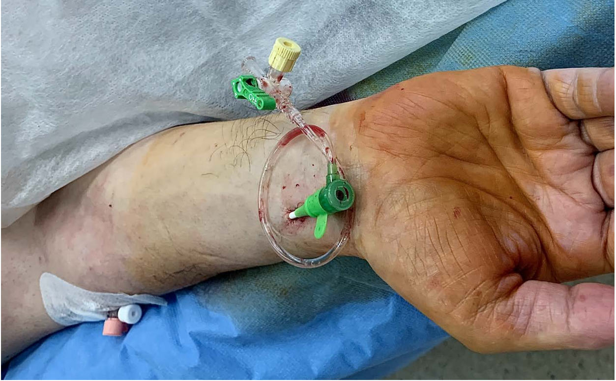
Figure 2. Traditional transradial access