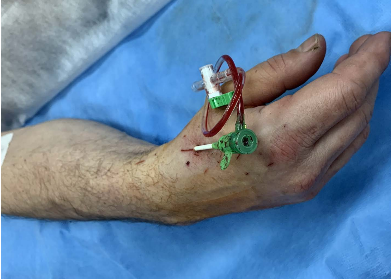
Figure 1. Distal transradial access