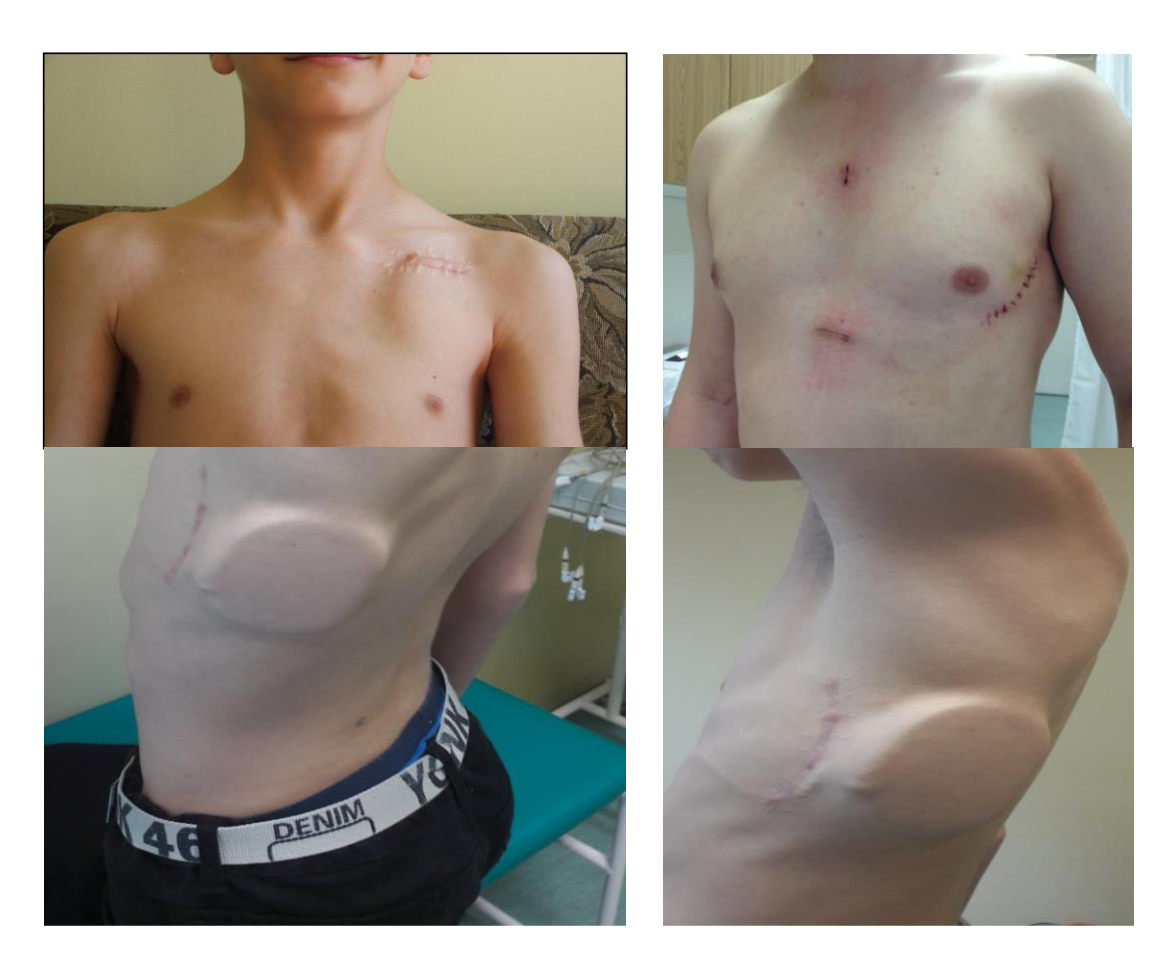
Figure S2. Typical chest pulse generator position. Upper panels, left: transvenous implantable cardioverter defibrillator (T-ICD) in a 12-year-old boy, right: Subcutaneous implantable cardioverter defibrillator (S-ICD) in a 19-year-old male. Lower panels, left and right: S-ICD in a 15-year-old boy (body mass index, 15.6 kg/m²). All patients or their legal representatives provided written informed consent for photo publication.