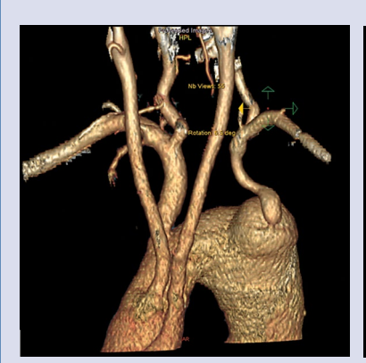
Figure 1. Preoperative 3D CT reconstruction of the RAA-aLSA. Four vessels branching from the arch in the following order: left CCA, right CCA, RSA, and aLSA branches from the aneurysmal Kommerell diverticulum, with significant stenosis in its proximal part