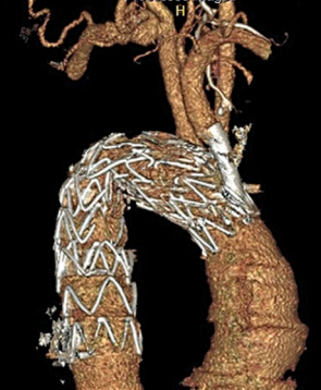
Figure 2. Follow-up control 48 months after the last procedure. The posterior view of the RAA-aLSA confirms correct stent-graft position, successful exclusion of the aneurysm, without endoleaks, and patent stents in RSA