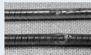
Figure 3. Silicone insulation breakage in macrophotography