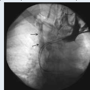
Figure 2. Collateral circulation with the inflow by right brachiocephalic vein (arrows)