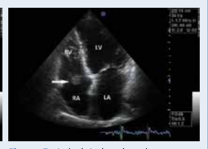
demonstrating tricuspid valve mass attached to the anterior tricuspid leaflet (arrow); RV - right ventricle; RA — right atrium; LV — left ventricle; LA — left atrium

Figure 4. Modified parasternal short-axis Figure 5. Apical 4-chamber view view demonstrating tricuspid valve (TV) mass attached to the anterior tricuspid leaflet (arrow); RV — right ventricle; RA — right atrium; LA — left atrium