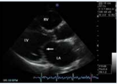
Figure 1. Parasternal long axis view. Thin akinetic posterior wall of the left ventricle (LV) and lack of mitral leaflets coaptation (arrow); RV - right ventricle; LA — left atrium

neoplastic tumour or vegetation should be considered. Transoesophageal echocardiography (TEE) confirmed both left and right sided pathologies. Based on clinical assessment, TTE and TEE findings, the patient was referred for cardiac surgery. Mitral valve replacement with implantation of bioprosthesis (Hancock II 27 mm), resection of TV tumour and valvuloplasty with ring implantation (C-E Classic Tricuspid - 32 mm) was performed. The histopathological diagnosis was myxoma of TV. Among all myxomas, this localisation is rarely encountered. The tumour is usually clinically silent and may be detected accidentally.