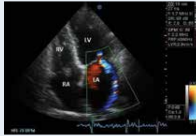
Figure 2. Colour flow Doppler in an apical 4-chamber view. Systolic excentric colour flow of severe mitral regurgitation in the left atrium (LA); RV - right ventricle; RA — right atrium; LV — left ventricle

Figure 1. Parasternal long axis view. Thin akinetic posterior wall of the left ventricle (LV) and lack of mitral leaflets coaptation (arrow); RV - right ventricle; LA — left atrium