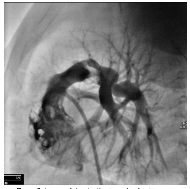
Figure 3. Image of dysplastic stenosis of pulmonary artery, narrow annulus of the valve and no signs of extension of the pulmonary trunk

In the subsequent prospective echocardiographic investigations (every 12 months) a gradient of systolic transvalvular pressure remained similar to the post-interventional measurements in each group of children. These values at the end of the observation were as follows: group I – 13.4 \pm 6.9 mmHg; group II – 16.9 \pm 12.1 mmHg; and group III – 17.1 \pm 12.2 mmHg. The incidence of subvalvular stenosis of pulmonary artery