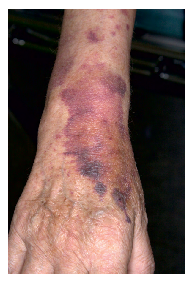
Rycina 4. Senile purpura

BPAs is their high effectiveness in inhibiting bleeding in the course of AHA, confirmed by the results of clinical trials [1, 29–34]. According to EACH2 registry, the effectiveness of both drugs is comparable and amounts to 91.8% for rFVIIa and 93.3% for aPCC. The disadvantages of BPAs include: 1) no laboratory control over their effectiveness 2) higher risk of thromboembolic events caused by these drugs, especially in the elderly with concomitant risk factors of venous thromboembolism (VTE) or arterial thromboembolism (ATE). In EACH2, thromboembolic events were reported in 5/174 (2.9%) patients receiving rFVIIa and 3/63 (4.8%) patients receiving aPCC [32].