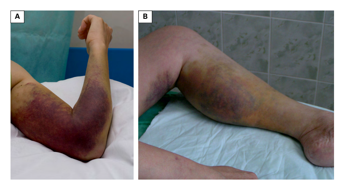
Figure 1. A, B. Extensive spontaneous subcutaneous blood extravasation in acquired hemophilia A

Of particular concern is the occurrence of AHA in patients on anticoagulantion therapy [17]. This is particularly true for the elderly, at high risk of diseases that require administration of anticoagulants or antiplatelet drugs for eg. atrial fibrillation, deep vein thrombosis and pulmonary embolism, or ischemic stroke. On the one hand, the coincidence of AHA and anticoagulant therapy may aggravate the symptoms of hemorrhagic diathesis, on the other, the diagnosis of AHA in a person on anticoagulant therapy is difficult, because the symptoms are automatically attributed to the anticoagulants effect. It should be emphasized that AHA diagnosis is practically always an indication for discontinuation of anticoagulant and antiplatelet therapy (see below) [16].