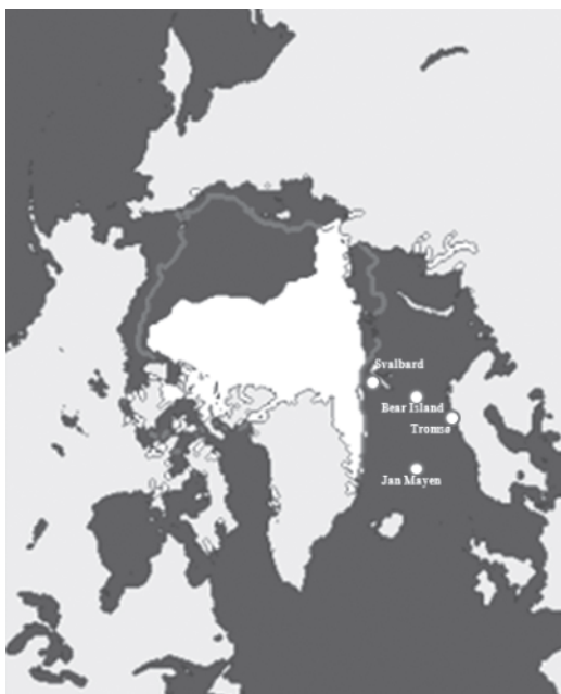
Figure 1. The Arctic Sea ( http://benmuse.typepad.com/ben_muse/arctic/ ). The white cover is the Arctic ice in September 2007

Today polar adventure operations in the Arctic have become steadily more popular, and during the summer time cruise liners access the coast of Greenland and north of Svalbard. In the near future, Svalbard may become even more important for air ambulance operations in the Arctic. Today, the Norwegian health care service in the region is based at the small hospital unit located at Longyearbyen, Svalbard. Due to limited staff, the hospital serves as a “preparedness hospital” taking care of primary health care and