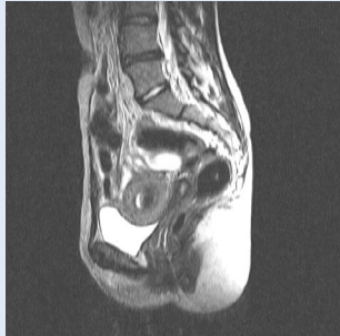
Figure 1. T2-weighted MRI scan showing no connection between the cervical canal and uterine cavity

In the initial anamnesis, it was learned that at the age of 10, the patient had undergone surgery to remove an immature teratoma of the left ovary at another hospital. Following the operation, adjuvant chemotherapy treatment was administered. The patient underwent surgery six years later. During that operation, an serous ovarian cyst of the right ovary was removed.