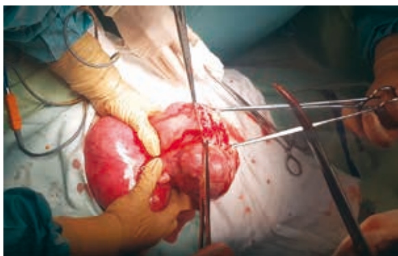
Figure 2. Gravid uterus compression by the 25 cm diameter leiomyoma