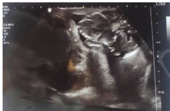
Figure 1. Patient's ultrasonography at hospital admission

On February 22, 2018, after the above-mentioned examinations, the patient was qualified and subjected to the conservative myomectomy. After receiving patient's consent, general anesthesia was conducted. After preparing the operating field, a midline incision of the abdomen (with navel omission) was performed. An enlarged, spherical uterus was revealed, with the dimensions corresponding to 18 weeks of gestation. In the right site of uterine fundus the myoma with a diameter of 25 cm, reaching the rib arches was found, accompanied by two smaller myomas — with diameter of 1 cm and 4 cm (Fig. 2). Enucleation of uterine fibroids was performed, next the sutures were put on