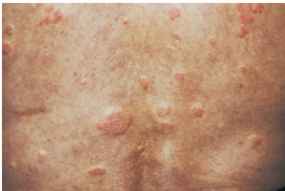
Figure 2. Urticarial efflorescences in the lumbar region widely variable in size

49.9 mg/L (normal range: < 5.0 mg/L). Complete blood count was evident for a microcytic anemia with decreased serum iron concentration and low total iron binding capacity. Immunological analysis of serum was highly positive for anti-C1q autoantibodies at 193.9 U/mL (normal range: < 10 U/mL) and negative for p-ANCA (perinuclear anti-neutrophil cytoplasmic antibodies), c-ANCA (cytoplasmic ANCA), ANA (antinuclear antibodies) and cryoglobulins. C3 complement concentration was found to be decreased at 0.8 g/L (normal range: 0.9–1.8 g/L). Computed tomography of the lungs was evident for emphysema. Direct immunofluorescence examination of the lesional skin