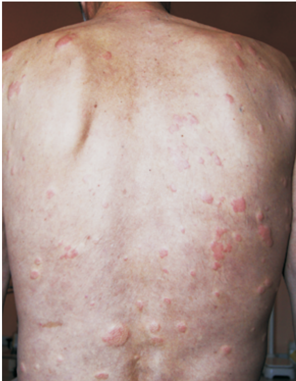
Figure 1. Widespread urticarial rash on the upper body