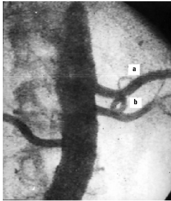
Figure 1. Aortonephrogram of the double left renal arteries. Single right renal artery; a — upper, b — lower.

Triple RA — three vessels originating from the aorta with different diameters and blood supply areas, and their branches entering the kidney through the hilum (Fig. 2).