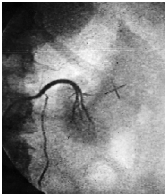
Figure 4. Selective angiography of the left renal lower perforating artery.

Accessory renal artery — originates from the aorta, the diameter of which being comparable to segmental arteries, supplying one segment only (upper or lower pole) entering the kidney through the hilum (Fig. 3).