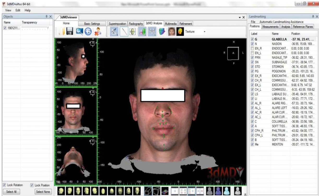
Figure 1. Points used in the analysis of three-dimensional face scan image data. 1) Glabella point (G') : It is the most anterior midpoint of the fronto-orbital soft tissue contour; 2) Soft tissue nasion point (N') : It is the most posterior point of the nasal root in the soft tissue contour; 3) Exocanthion (exr, exl) : It is the outer edge point of both eyeballs; 4) Pronasale point (Prn') : It is the most anterior point of the tip of the nose. If there is a bifid nasal structure, the most anterior point should be chosen; 5) Subnasale point (Sn') : It is the point on the nasolabial soft tissue contour of the junction of columella and upper lip; 6) Alare points (Alr, All) : The outermost points of both alar curvatures; 7) Alar curvature points (Acr, Acl) : The junction points of both alar bases with the facial structure; 8) Columella point (C') : It is the midpoint of Columella at the nostril top point level; 9) Soft tissue A point (A') : It is the deepest point of philtrum; 10) Labiale superius point (Ls) : It is the midpoint of the upper lip on the vermilion line; 11) Crista philtri points (Cphr, Cphi) : They are the junction points of the vermilion line and the upward edges of the philtrum; 12) Stomion point (Sto) : It is the horizontal midpoint of the joint of the two lips when the lips are closed. If the lips do not close when the patient is in the resting position, it is the point in the middle of the gap between the lips; 13) Cheilion points (Chr, Chl) : They are the edge joints of the lips; 14) Labiale inferius point (Li) : It is the midpoint of the lower lip on the vermilion line; 15) Soft tissue B point (B') : It is the deepest point of the labiomental soft tissue contour between the lower lip and the tip of the chin; 16) Soft tissue pogonion point (Pog') : It is the outermost point of the chin tip; 17) Soft tissue menton point (Me') : It is the lowest point of the soft tissue contour of the chin tip. It corresponds to the projection of the skeletal menton point.

philtrum length to mouth width, the ratio of mouth width/total vermilion length, upper lip length/lower lip length, the ratio of upper lip vermilion length/lower lip vermilion length, and the ratio of anterior facial height/lower facial height at the T0-T1, T0-T2, and T0-T3 periods.