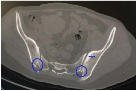
Figure 4. Axial computed tomography section image of the bilateral bipartite iliac bony plate variation (circled) at the S3 vertebral level in a 33-year-old woman patient. The blue arrow indicates subchondral sclerosis at the S1 vertebral level.