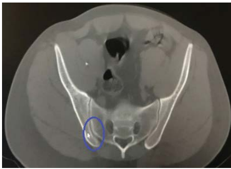
Figure 5. Unilateral axial computed tomography section image of the crescent like iliac bony plate variation at the S2 vertebral level in a 26-year-old man patient.