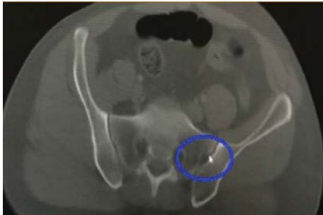
Figure 6. Axial computed tomography section image of the semicircular defects variation at the S1 vertebral level in the sacral bony in a 40-year-old man patient.

In addition, the bipartite iliac bony plate variation was determined in a total of 7 (4.8%) patients, 1 (1%) man and 6 (14.5%) women. The bipartite iliac bony plate was observed to be unilateral in 4 (10.7%) patients and bilateral in 3 (4.8%) patients. As a result of this observation, the variation is characterized by a two-part shape, unlike the normal appearance of the ilium, as well as being mostly detected at the