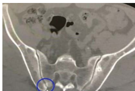
Figure 2. Image of right accessory sacroiliac joints at the S2 vertebra level on the axial computed tomography section in a 56-year-old man patient. A protrusion, extending from the iliac surface towards the sacral surface is observed.

While the incidence of variation of SJ in all cases in this study was 28.9%, the incidence of ASJ was 6.8%. The incidence of accessory SJ was detected to be 7.8% in men and 7.2% in women. The ASJ