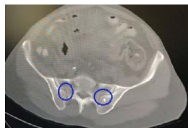
Figure 3. Axial computed tomography section image of the bilateral iliosacral complex at the S2 vertebra level in a 60-year-old man patient. A protrusion and matching cavity is observed on the iliac surface.

was observed to be unilateral in 9 (12.6%) cases and bilateral in 1 (2.4%) case. This variation was determined to form a process from the iliac surface towards the sacral surface in the posterior aspect of the SJ (Fig. 2).